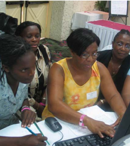
Teachers strengthening their competencies through the use of computers.