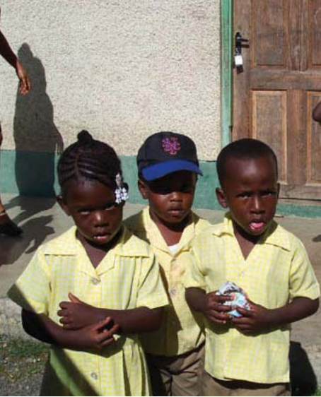
Students benefiting from the Transitions Program.