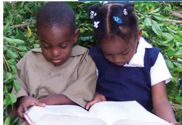
Two first grade students from Drews Avenue Primary School.

Latin American and Caribbean Education Profiles 1999–2004