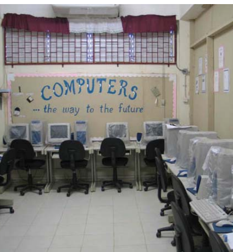
USAID-funded Technology Center.

neighboring schools and are equipped with appropriate technology to support student learning, teacher learning, and teacher professional development. In the new strategy, USAID will provide funding to further integrate technology in education.