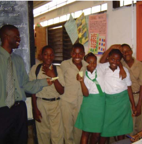
UAP students and their teacher after a training workshop.