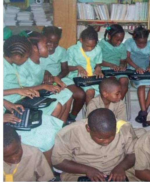
Students at St. Peter Claver using technology to learn the alphabet.

The USAID/Jamaica resources available for education have grown substantially over time, with Development Assistance 5 (DA) funding increasing 75 percent from $2.8 million in 1999 to $5 million in 2005. 1999 was the second year of the New Horizons for Primary Schools project, thus the funding level was lower than in later years. Funding rose in later years to cover the infusion of technology in education and the installation of 20 Professional Development Centers. These centers are strategically placed to support