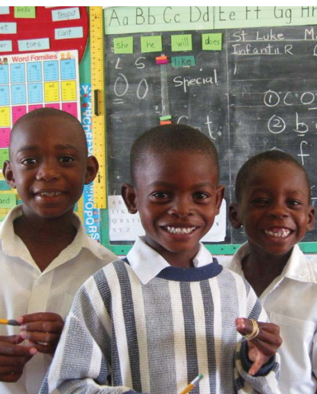
Pupils in a CETT classroom enjoy learning together.