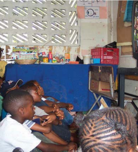
Students engaged in lesson at a New Horizon's Technology Center.