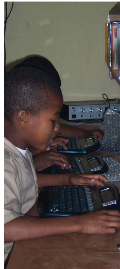
Students using technology to learn the alphabet.

10. Reading skills are central. The adolescents most at risk of dropping out of the Uplifting Adolescents Project are those who enter as nonreaders, while those with better reading skills are more likely to complete the program and move into school or work environments. Uplifting Adolescents teachers would thus benefit from support (training and resources) in teaching basic reading.