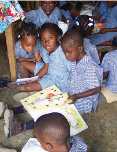
Young students at NHP school.