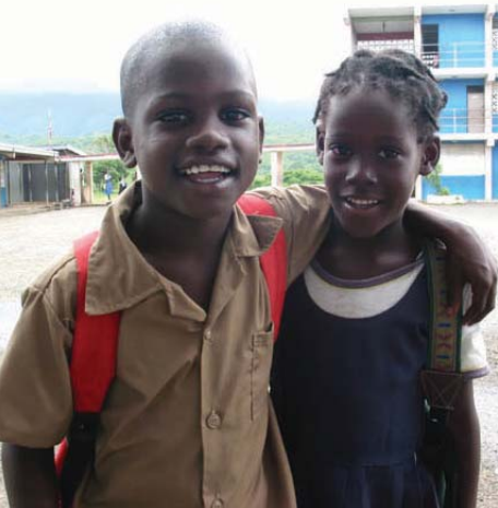
Two students from Manchioneal All Age School.