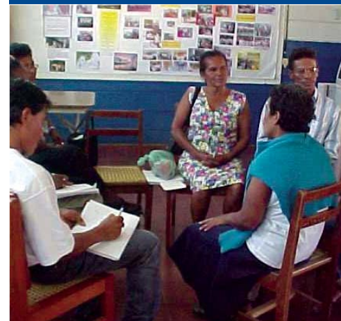
Parents participating in a school meeting.