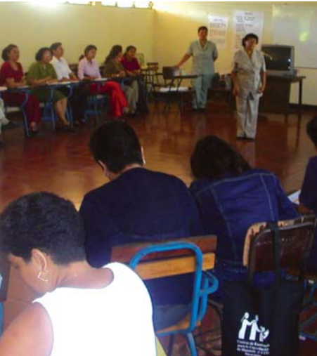
Nicaragua CETT teacher training session.

Implemented in Nicaragua by the Ricardo Morales Avilés Normal School Dates: September 2003 to September 2008 10 Funding: $8,497,683 (to date)