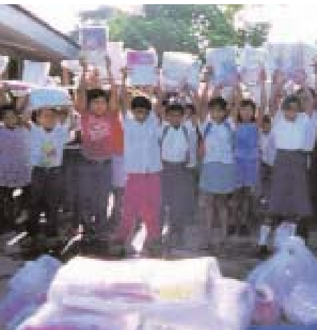
Children holding education kits supplied after Hurricane Mitch.