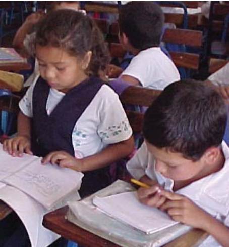
First grade students working on independent reading assignment in USAID-supported school.

The strategy emphasized improvements in the quality and efficiency of primary education through strengthening teacher performance, implementing more effective curricula, decentralizing the education system, and increasing parent/community participation. Education activities took place under the BASE (for Basic Education) Project, from 1994 through 1998.