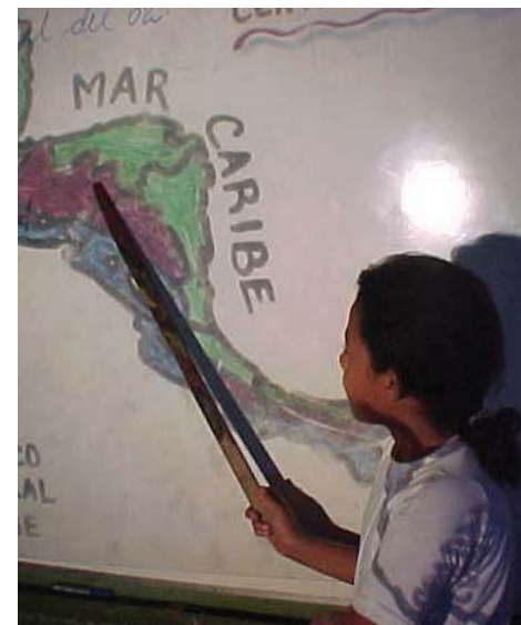
Third grade student in CETT-supported school demonstrating knowledge using a teacher-made map.

Because gains in these areas are still fragile and vulnerable to rollbacks, it is necessary to strengthen and extend achievements in the social sector for greater national impact. Thus, over the next five years, USAID will support the MECD in leading the nationwide expansion of community participation and the active teaching and learning approach through CAPs. USAID also will continue to emphasize improving access and quality in the public and primary education system.