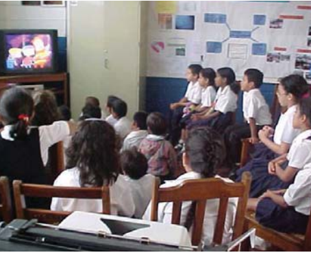
Grade 2 students learning through audio-visual technology.

new methodologies, at least in the short term, without targeted support and a network of practical assistance. To promote sustainable change, various reform interventions must be conceived holistically, as part of a larger integrated model.