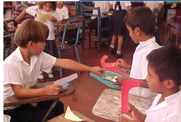
Students learning through cooperative activities in BASE II-supported school.

Latin American and Caribbean Education Profiles 1999–2004