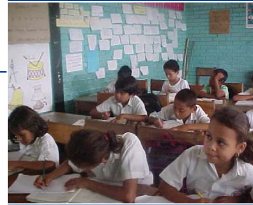
Students in CETT-supported classroom working on their reading skills.