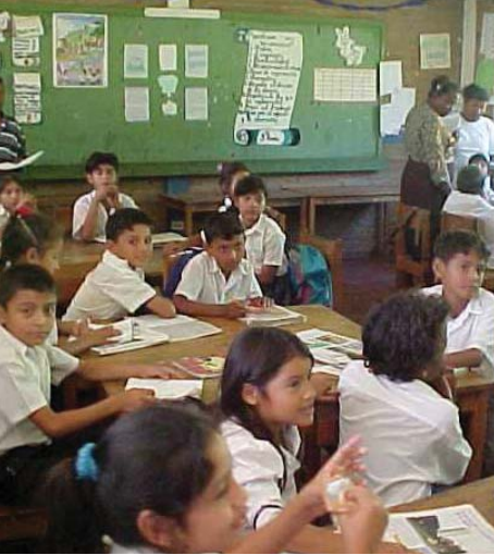
This third grade classroom exemplifies the regular use of a variety of learning materials, cooperative seating arrangements, and interactive learning techniques to improve reading.

Model school students have shown steady, and in some cases dramatic, increases in mastery of Spanish and mathematics over the three years that achievement tests have been administered. All classrooms tested showed a collective increase in mastery of 31.4 percent in third grade and 28.3 percent in fourth grade.