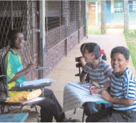
Students enjoying small-group work assignment.